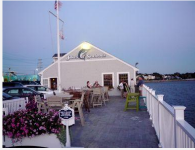
1Photo credit: Jake's Seafood website

Jake's Seafood have been named Best of Boston and have been the reigning Best of South Shore dining from 2009 to 2011. Menus, hours, and directions are here: http://www.jakesseafoods.com/